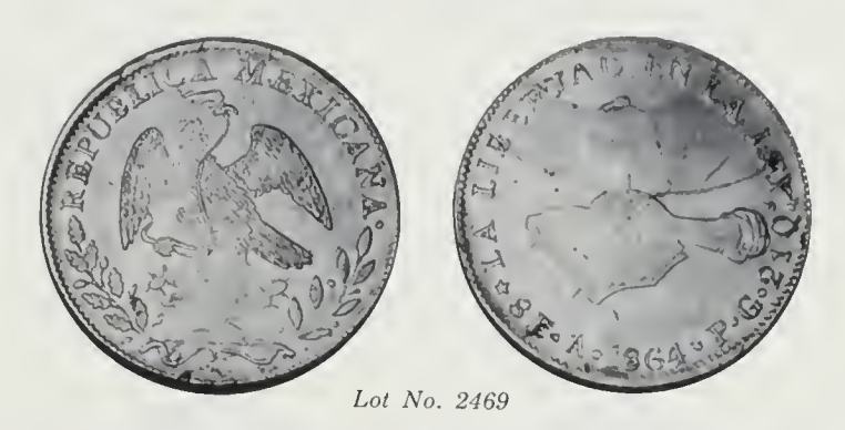
8 Escudos, 1864 A-PG. Alamos. Obv. Eagle holding a snake in its beak and perched on a cactus. Rv. A hand holding a Liberty cap on a stick, a book of laws behind. KM 383, Fr.65. The first year of issue for the 8 Escudos, which was struck at Alamos in only five separate years between 1864 and 1872. This specimen was struck from a very poor set of dies. Most dramatically, there is a large, crescent-shaped exfoliation of the die in evidence on the reverse. It is a wonder that such a pair of dies was in use and that coins struck from them were issued. The 8 Escudos from Alamos are second only to those of Estado de Mexico in rarity. This specimen is technically Extremely Fine. Rare. (SEE COLOR PLATE) (2,750–3,500)